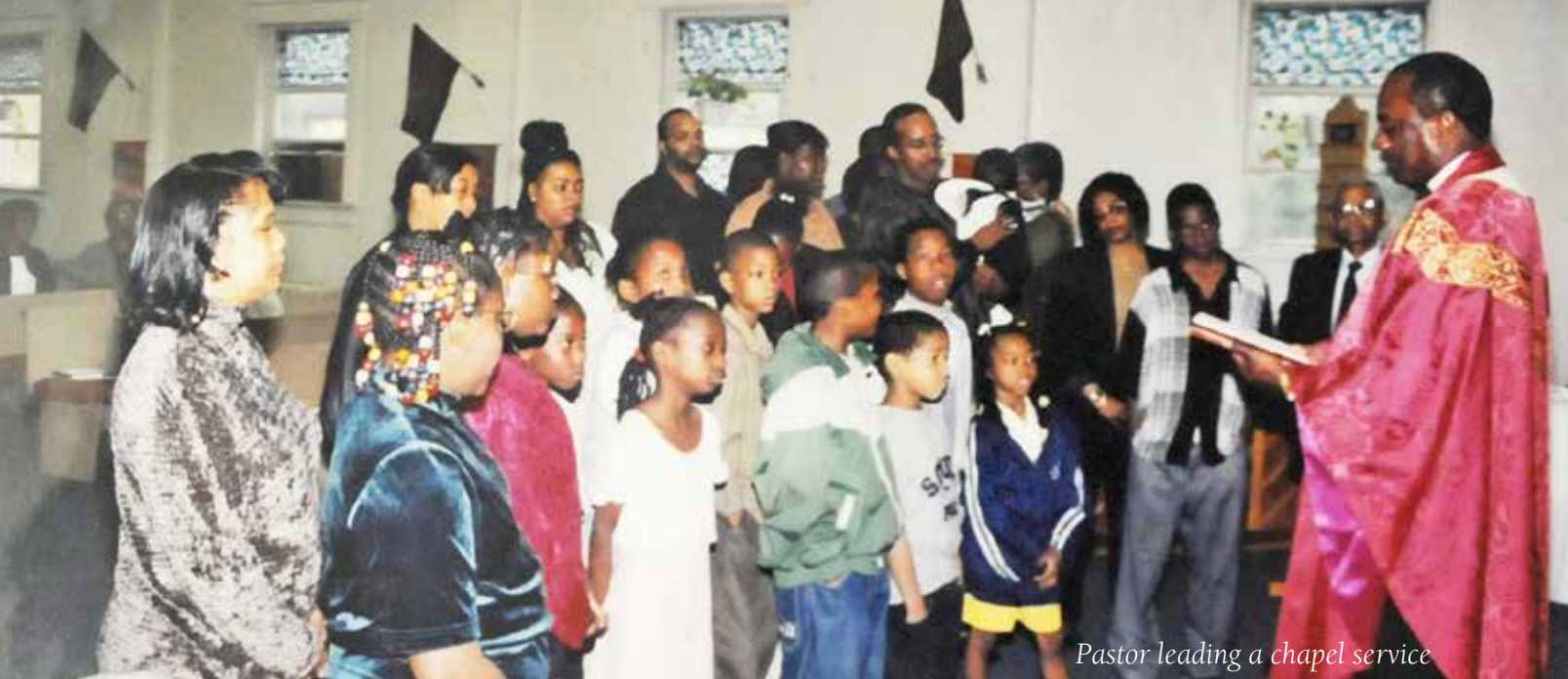
Pastor leading a chapel service