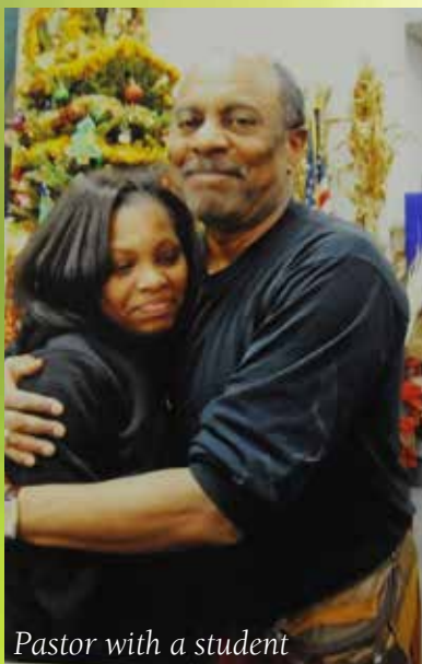
Pastor with a student