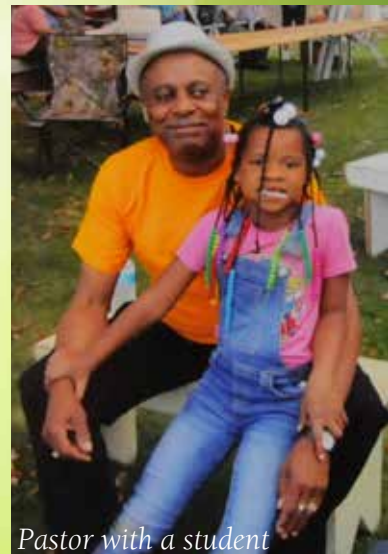
Pastor with a student

Unity has had the support of various organizations over the years, and Concordia Lutheran Ministries has been able to lend a hand since the early 2000s.